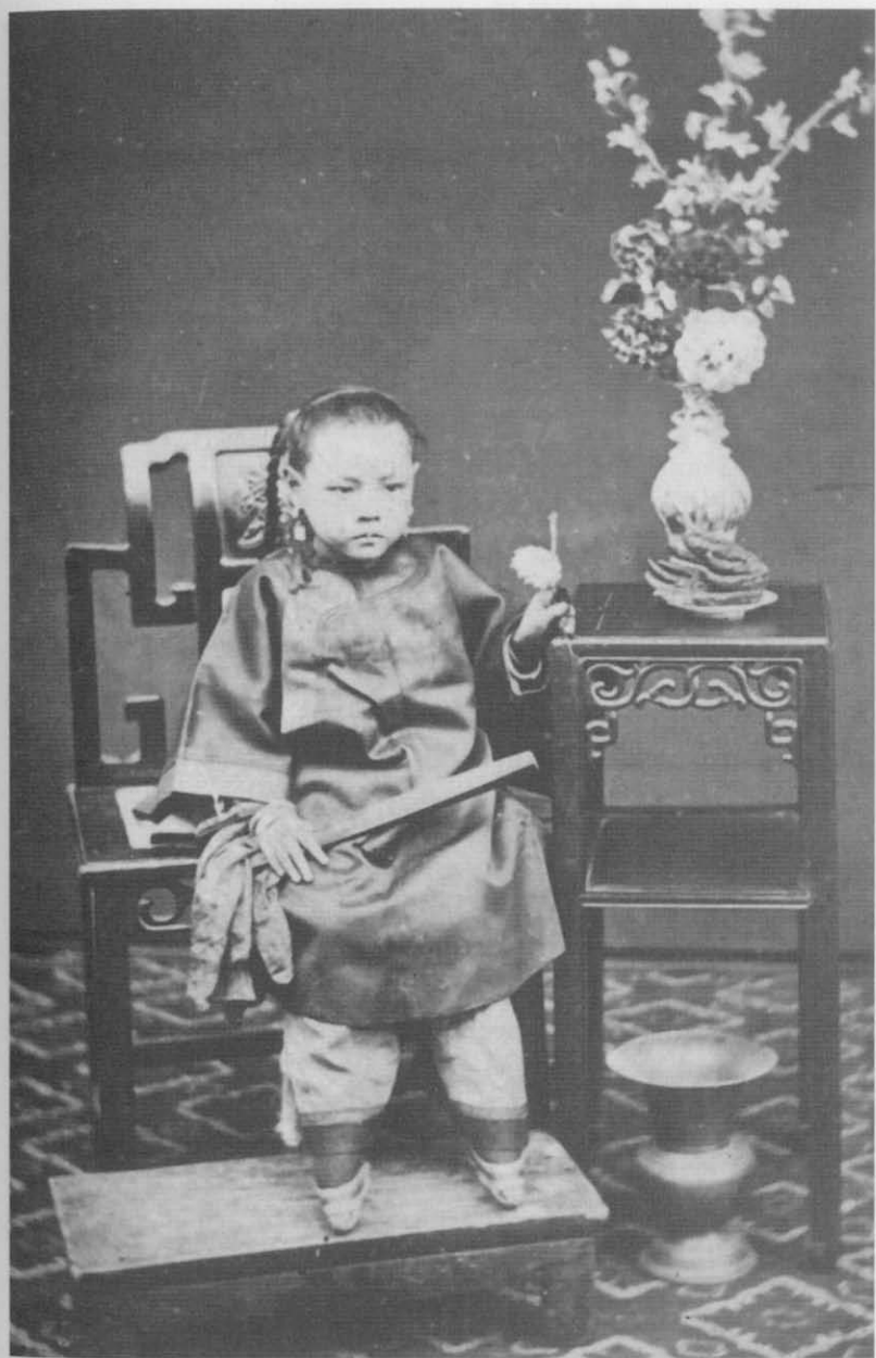
Figure 1. Chinese child with bound feet.