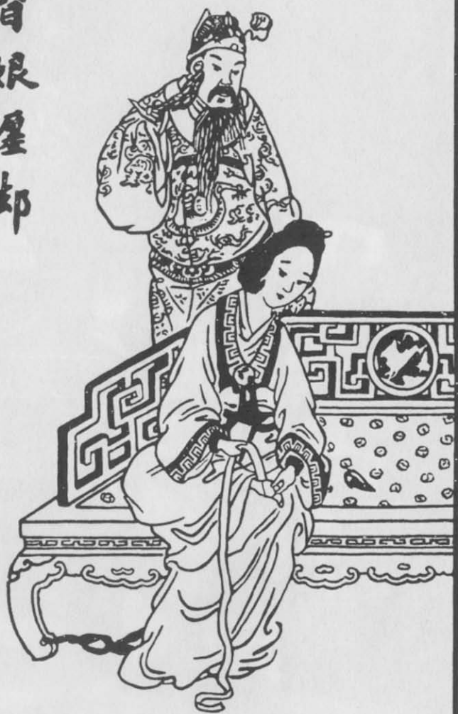
Figure 2. Yao Niang binds her feet. Drawing from Cai fei lu .